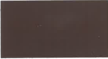
Berry TSR = .29