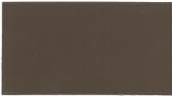
Cocoa Brown TSR = .35