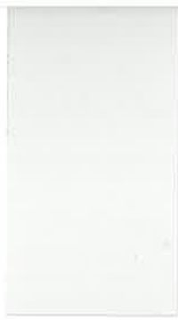
Polar White TSR = .64