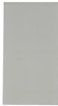
Ash Gray TSR = .46