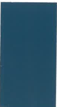
Gallery Blue TSR = .25

Sherwin-Williams® and WeatherXL™ are trademarks of SWIMC LLC.