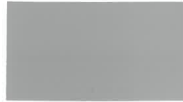
Old Town Gray TSR = .41