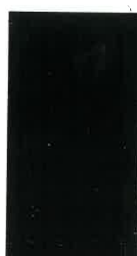
Black TSR = .31