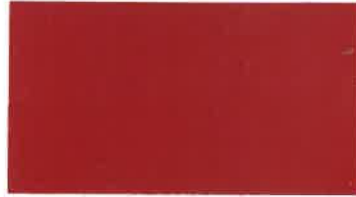
Crimson Red TSR = .31