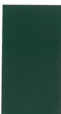
Ivy Green TSR = .28